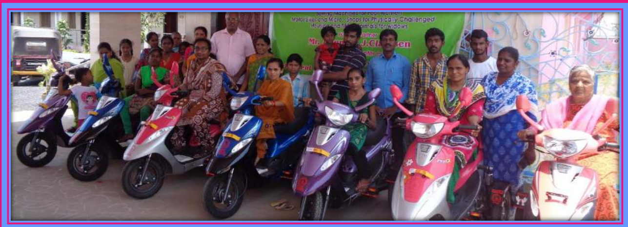
Mobility for the Physically Challenged:

The project rationale is to assist 20 physically challenged persons aged between 18–35 living a miserable state of life without any means of livelihood. They belong to the socially marginalized, poorest and the most exploited. They find it hard to make living because of their disability. The project is to assist them to set up small business enterprises such as vegetable selling, provision shop, fruit shop etc., which will enable the physically challenged to earn their living, improve their socio-economic situation, become self-reliant and lead a decent life.